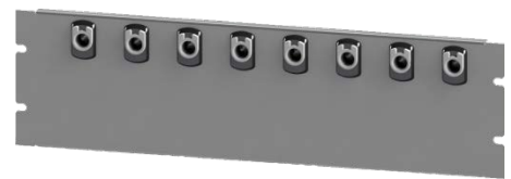
SD 8 V2